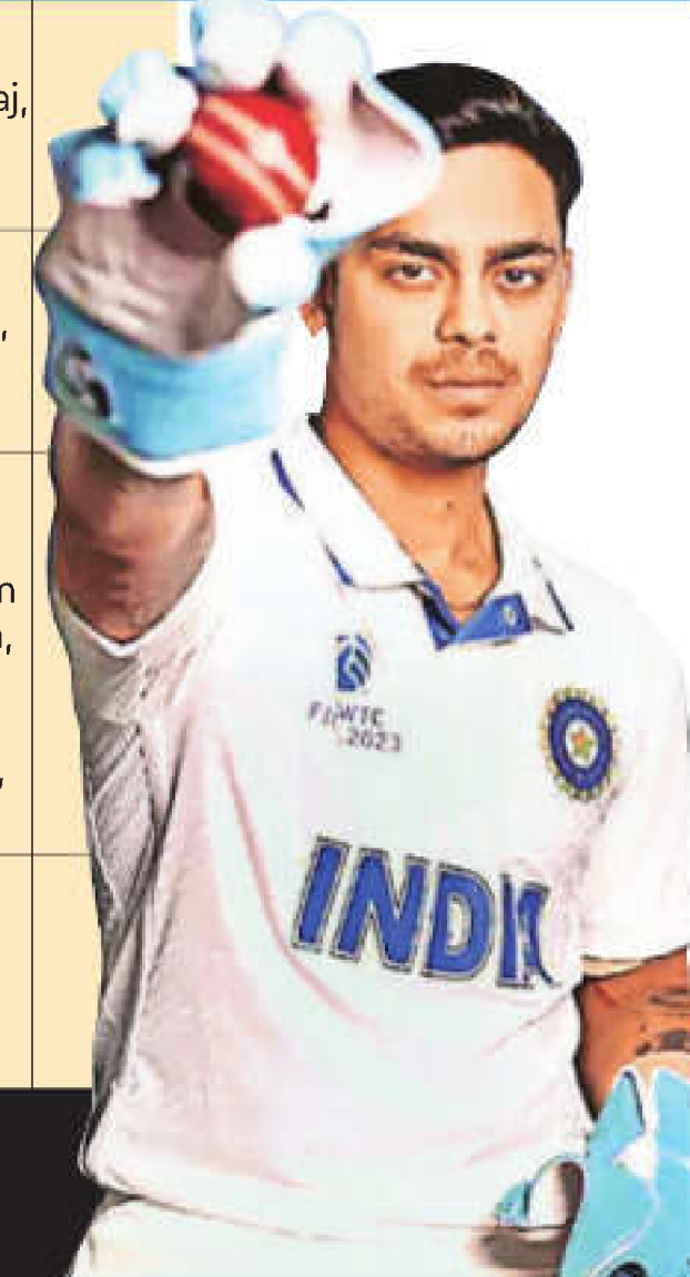
Shreyas Iyer (left) and Ishan Kishan will be paid only match fees even if they play for India in the immediate future